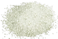
PLASTIC MEDIA, TYPE V