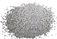
STEEL SHOT, STAINLESS