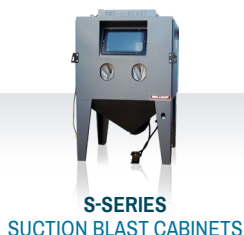
S-SERIES SUCTION BLAST CABINETS