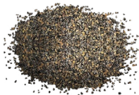
GARNET, HARD ROCK