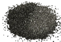
STEEL GRIT, CARBON