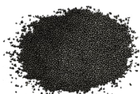
STEEL SHOT, CARBON