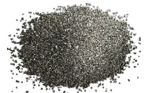
STEEL GRIT, STAINLESS