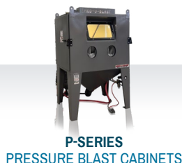
P-SERIES PRESSURE BLAST CABINETS