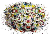
PLASTIC MEDIA, TYPE III