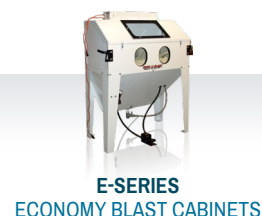
E-SERIES ECONOMY BLAST CABINETS