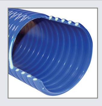
A rugged PVC helix resists collapse at full vacuum and allows the hose to bend and flex around corners without kinking.

Our commitment to producing the highest quality products in the industry demands strict control over our raw materials and manufacturing processes. All components used in the manufacturing of Marco products adhere to strict process controls as specified by Allredi's Quality and Engineering team.