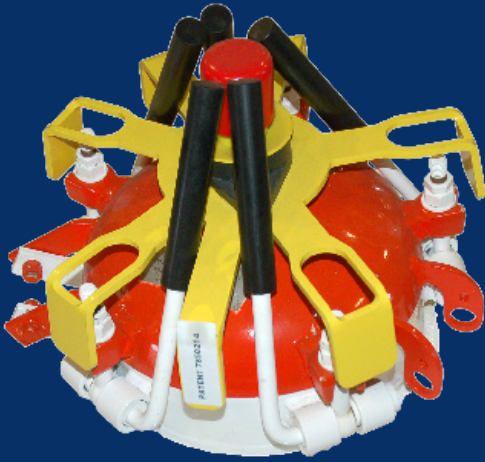
10-inch HALOK Safety System

Attempting to open the 10-inch closure on a Schmidt® bulk unit while the vessel is pressurized, or attempting to pressurize a vessel with an improperly closed closure, can lead to serious injury or death. The HALOK® is a device specifically designed to be installed onto an existing 10-inch closure typically welded on top of a standard Schmidt Bulk Blasters. It mechanically directs the operator to follow proper procedures for opening and closing these types of 10-inch closures.