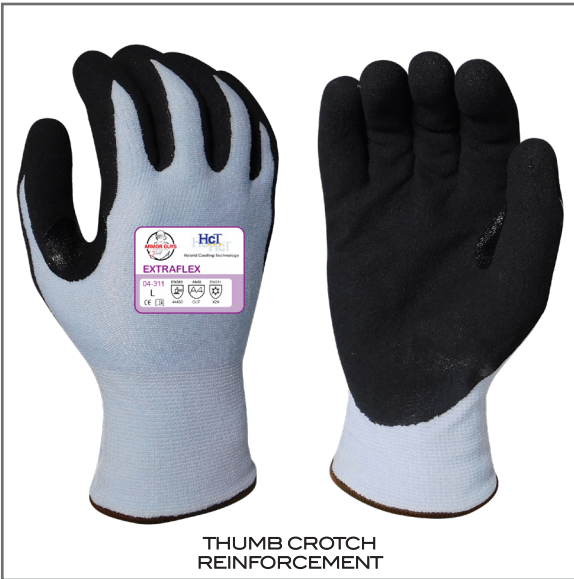
THUMB CROTCH REINFORCEMENT