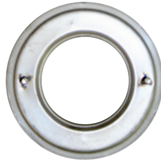
Open with Bolt Holes Top