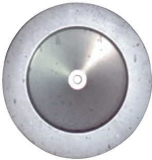
Closed with Bolt Hole Top/Bottom