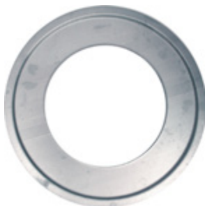
Round Flanged Top/Bottom