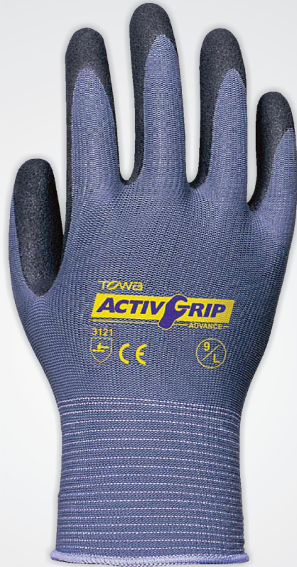
Cordova Style: AG581 Sizes: S-XXL