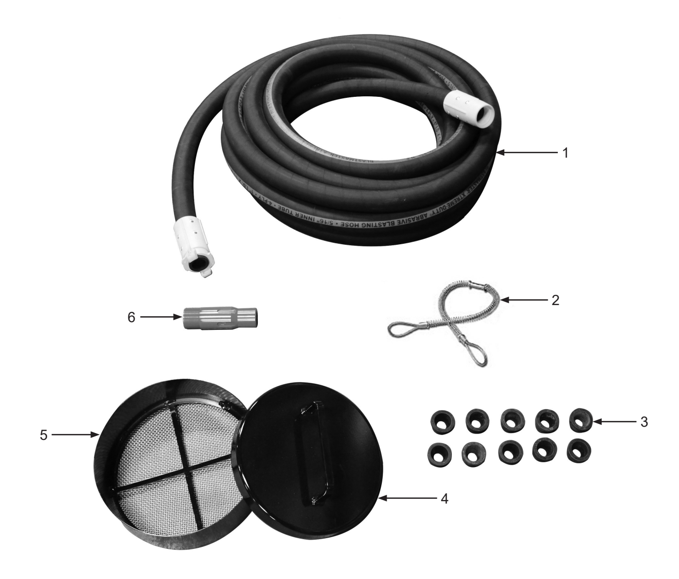
Figure 1: Abrasive Blasting Pot Package for 10" Diameter Abrasive Blasting Pots