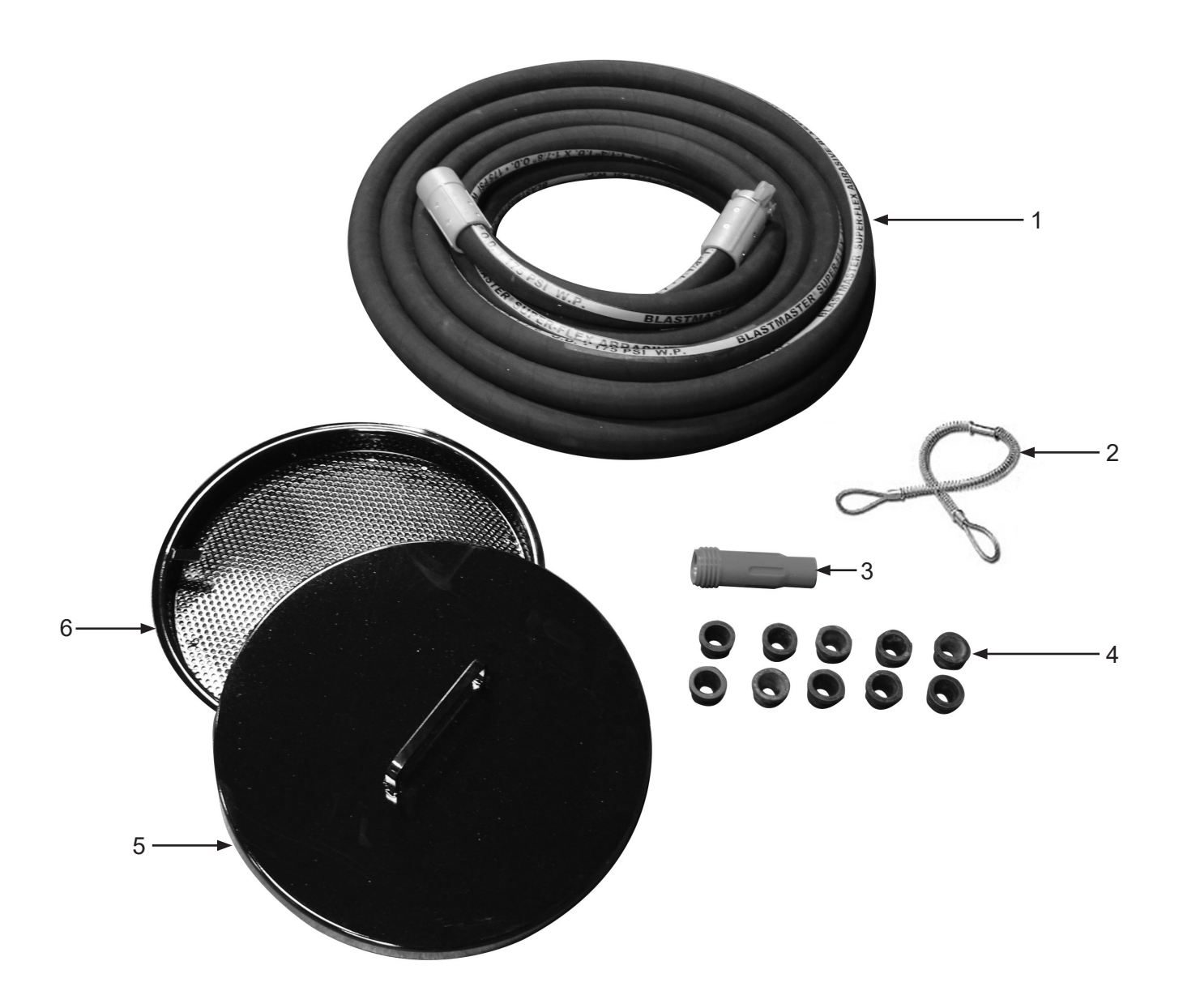
Figure 4: Abrasive Blasting Pot Package for 24" Diameter Abrasive Blasting Pots