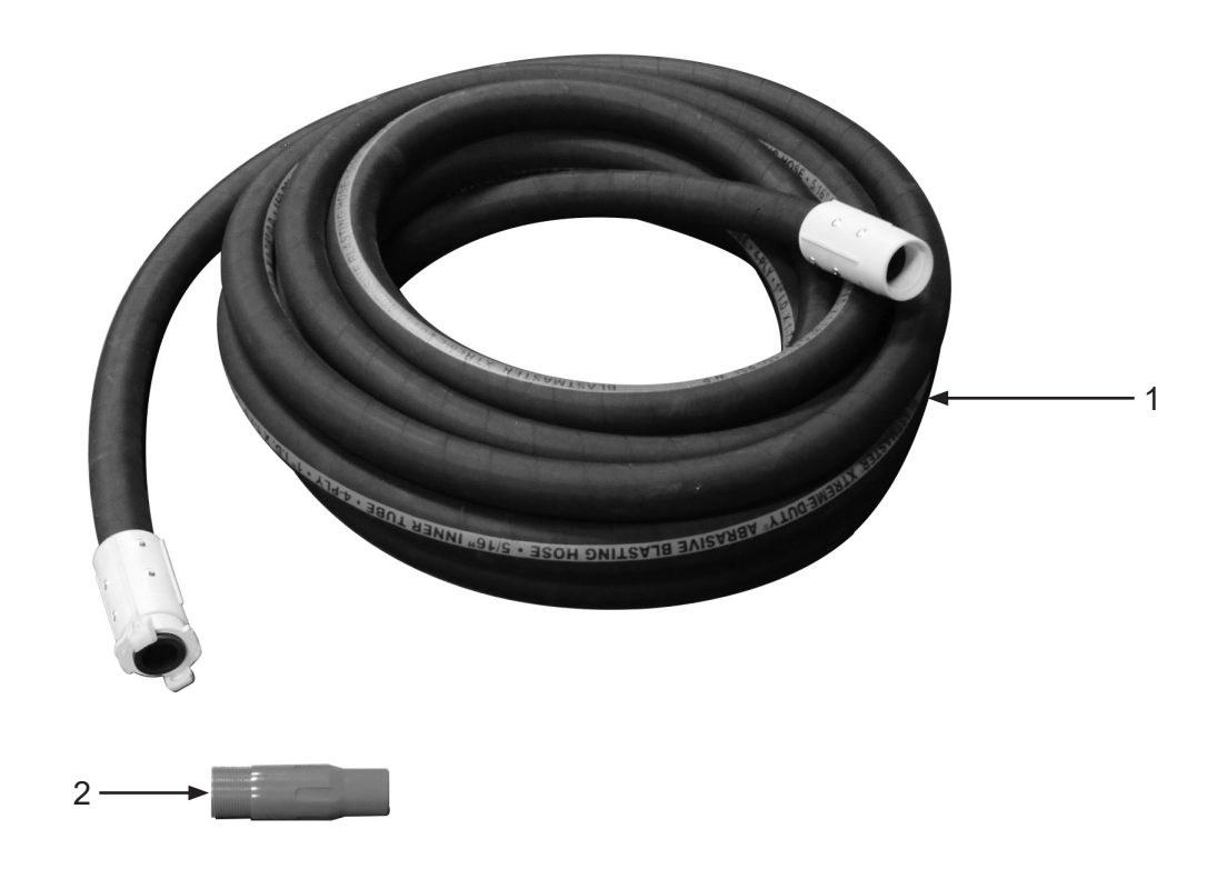
Figure 5: Hose, Nozzle, and Couplings Package 3B