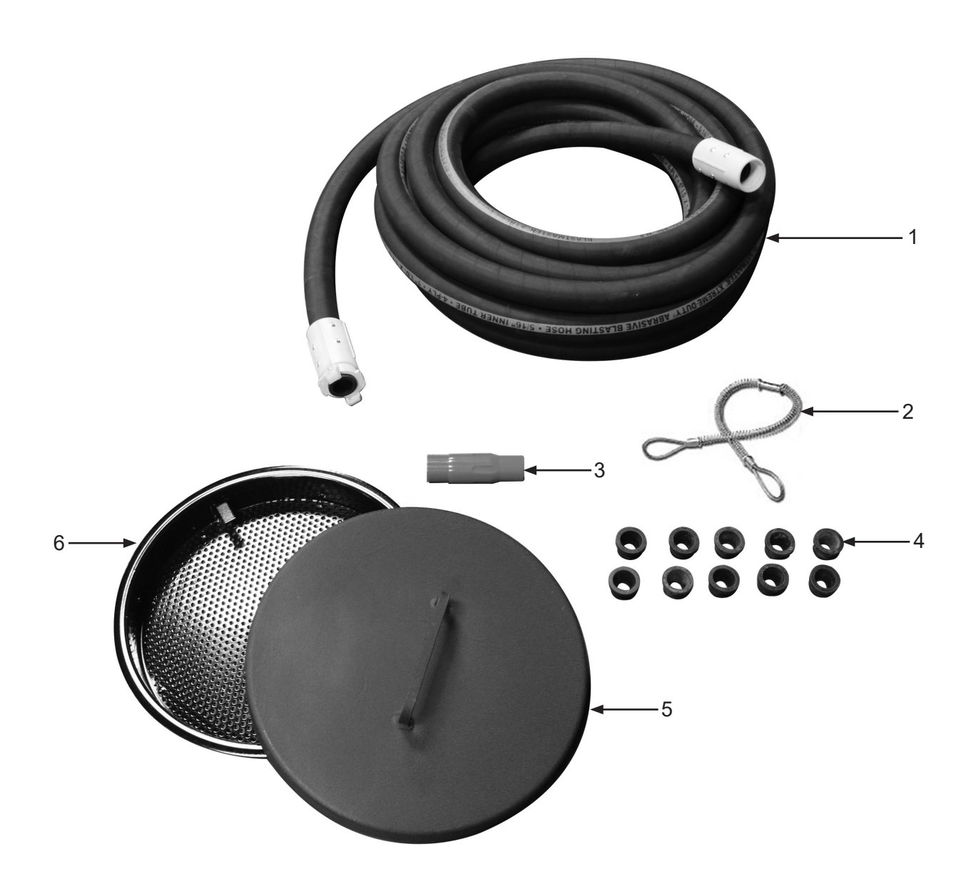
Figure 3: Abrasive Blasting Pot Package for 18" Diameter Abrasive Blasting Pots